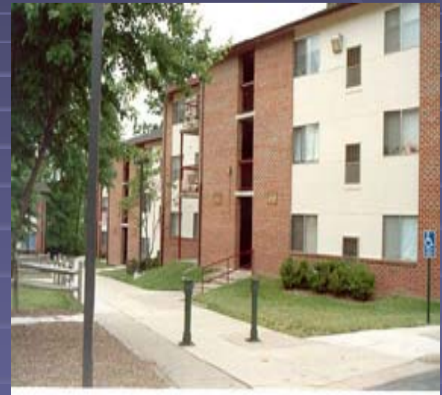
Fairfax County, VA