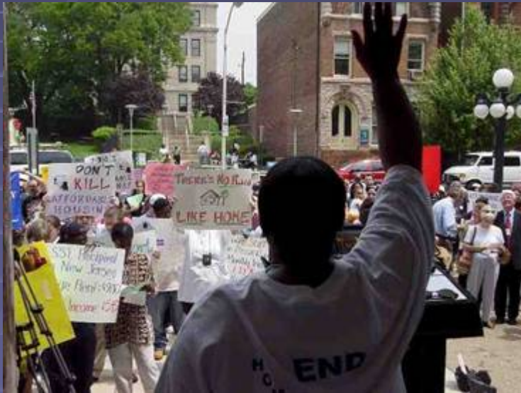
Housing and Community Development Network of New Jersey