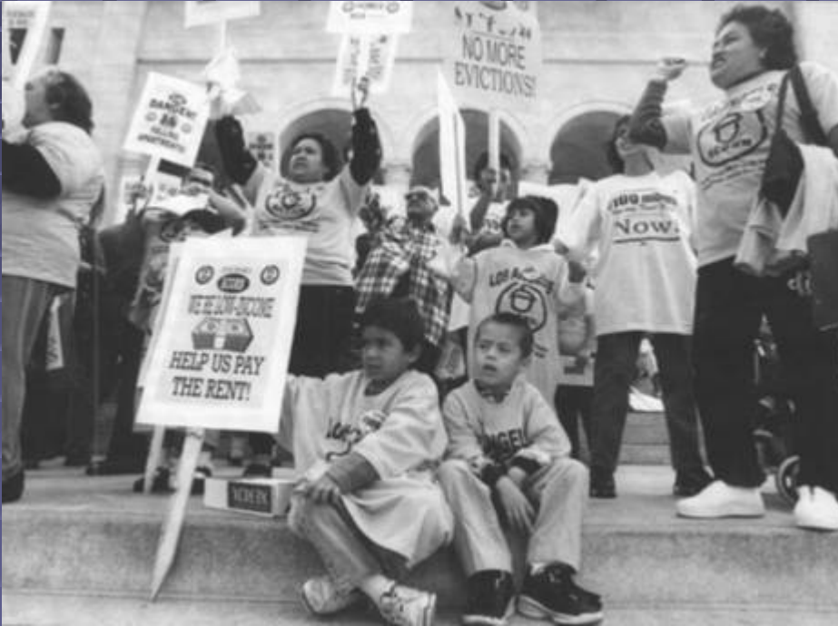
Housing LA members join ACORN in march and rally -- Shelterforce

Los Angeles commits to $100 million housing trust fund.