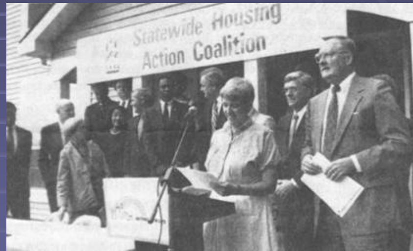
Illinois SHAC and then-Governor Thompson at Trust Fund signing ceremony