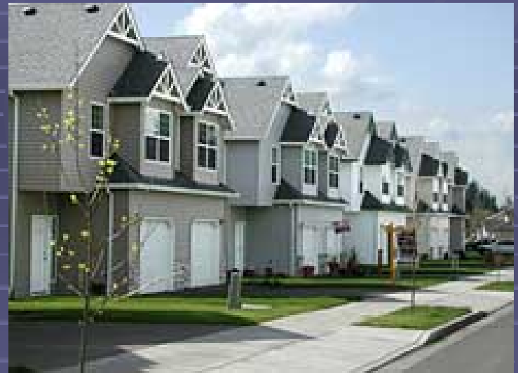
Affordable housing in Oregon