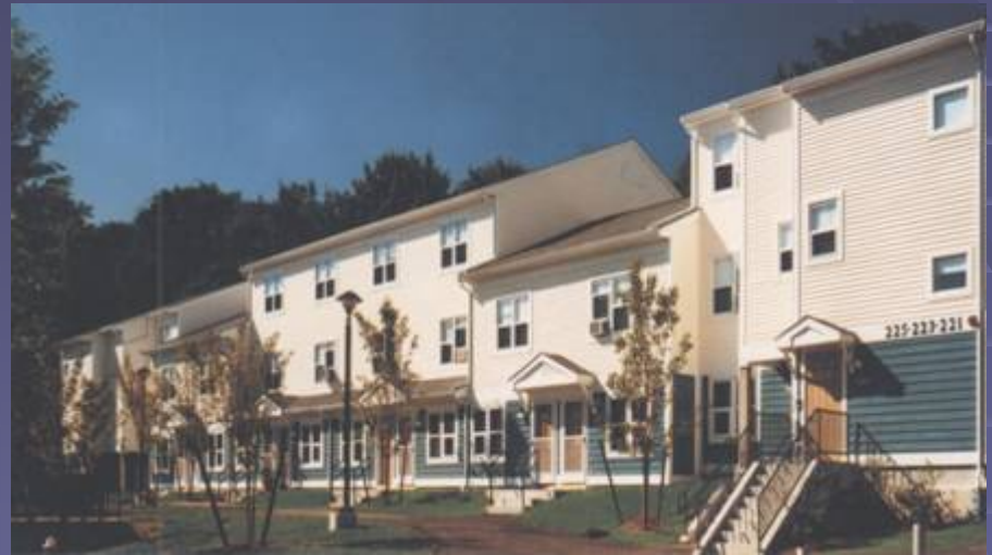
Massachusetts affordable housing