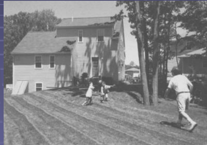
Connecticut affordable housing