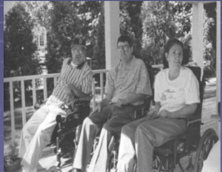
Chip's House in Massachusetts